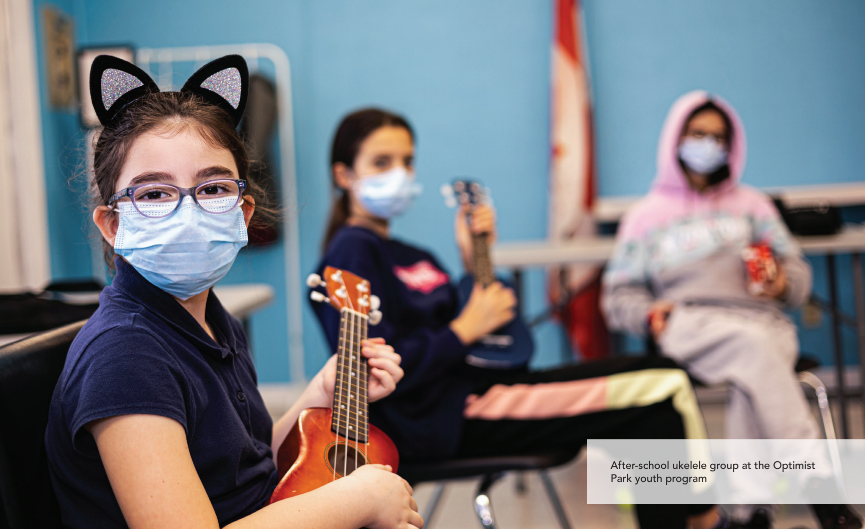
After-school ukelele group at the Optimist Park youth program